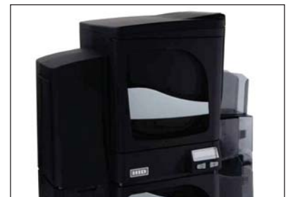
Custom overlaminates are available for a field-upgradable single- or unique, high-speed dual-sided simultaneous laminator.